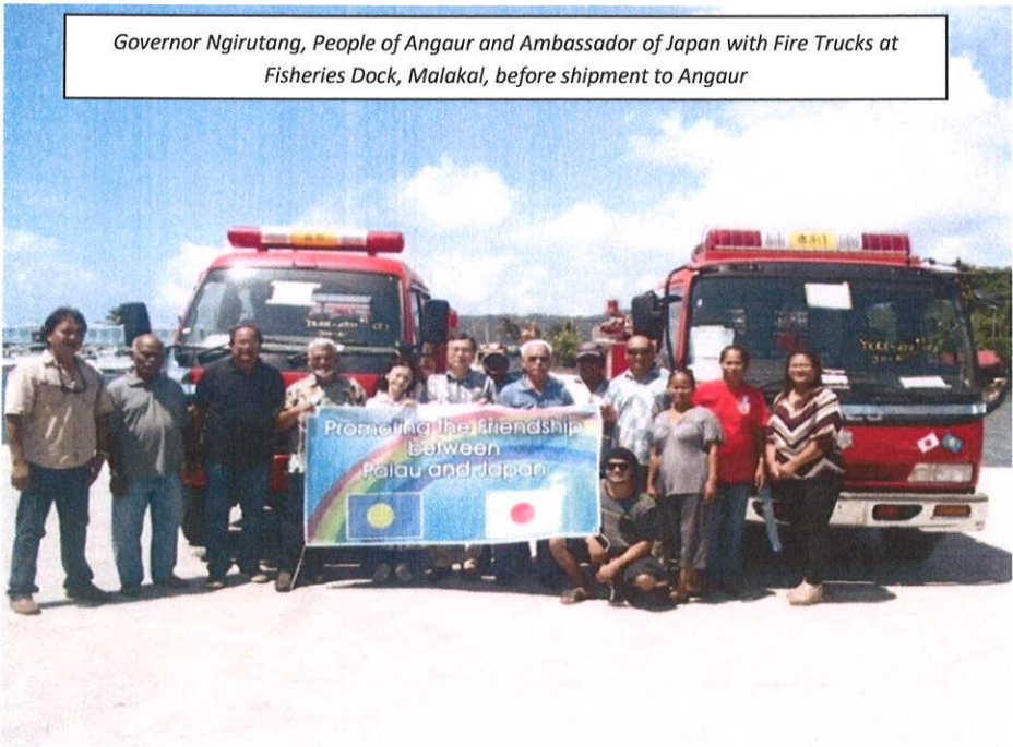
Pictures of refurbished Fire Trucks at Fisheries Dock, Malakal, before shipment to Angaur

The pictures below show the Fire Trucks at Fisheries Dock, Malakal, before shipment to Angaur: